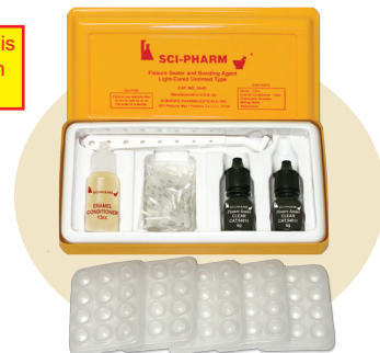
Cat. No. 54-01

Federal Law restricts this device to sale by or on the order of a dentist.